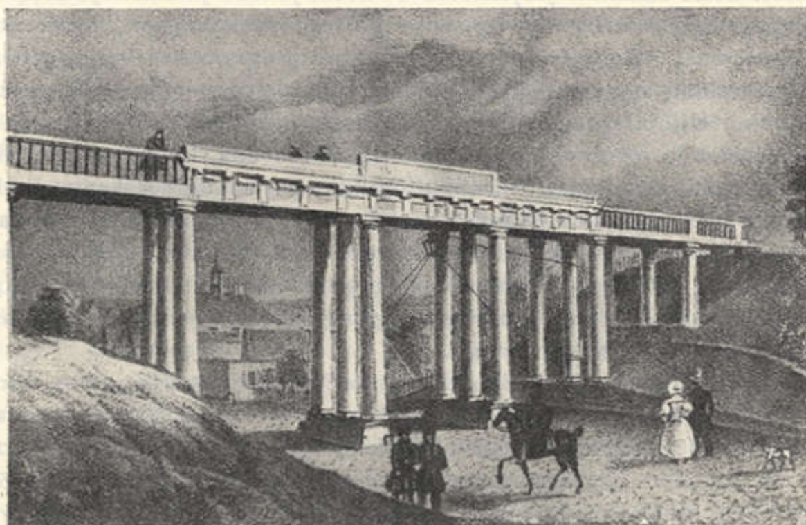
„Inglisild“ 19. sajandi I poolel.